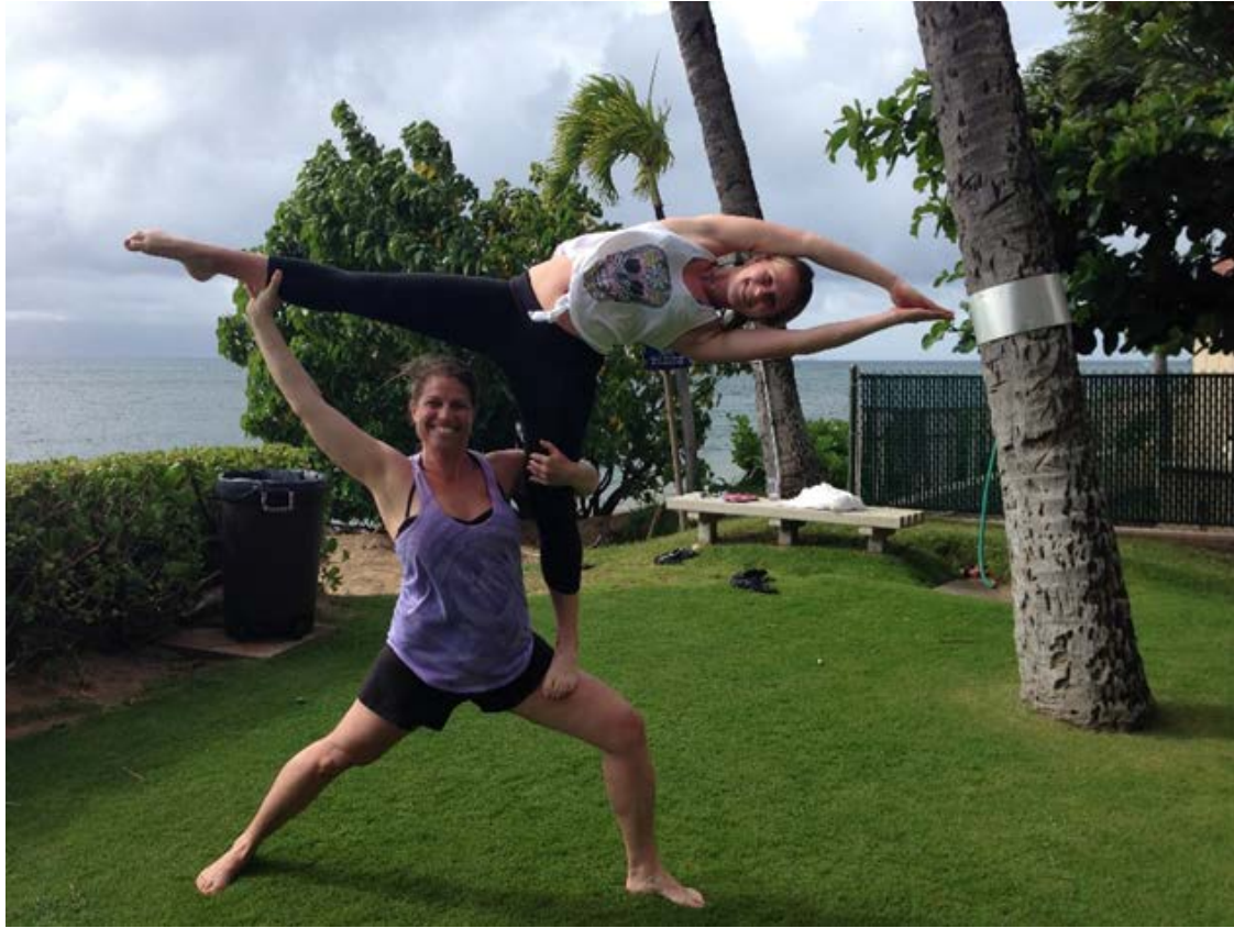
Yoga is better with friends 😊